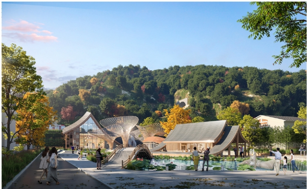
▲ Xiehejian Station

Xiehejian Station, which is the entrance to the West Beijing ancient road, is the place to enjoy the historical scenery of "On an ancient road a lean horse stands in the west wind.". There are many boutique homestays around the site distributed in the village.